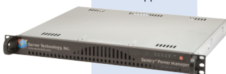
Expansion Module Model Numbers