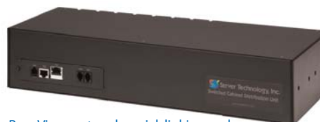
Rear View: network, serial, linking and temperature/humidity inputs