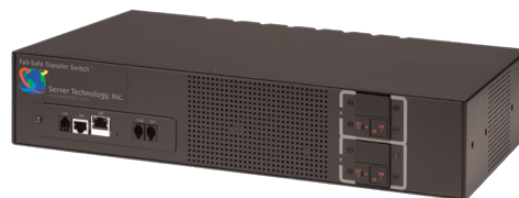
Rear View: Circuit Breakers, Network, serial, linking, and environmental inputs

VMware and VMware Ready is a registered trademark or trademark of VMware, Inc. in the United States and/or other jurisdictions